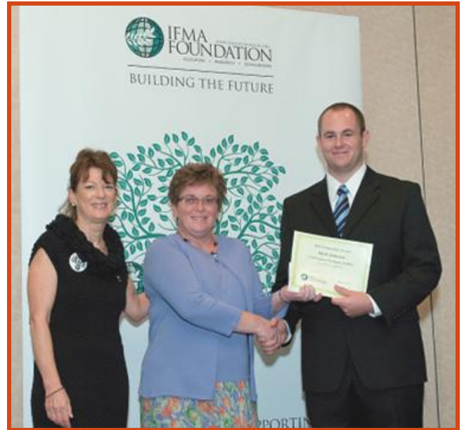
Thursday, October 8, 2009, Orlando, FL

Please remember that these Scholarships are awarded to students pursuing degrees in facility management OR a related field. We need more local applicants. Please be sure to inform any young professionals you may know who would fall under these categories about the scholarship opportunities.